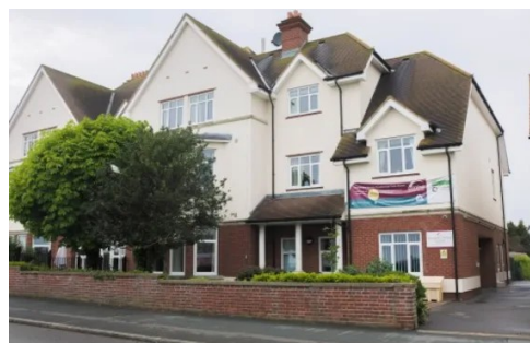
MHA Alexandra House, Dovercourt, Harwich, Essex